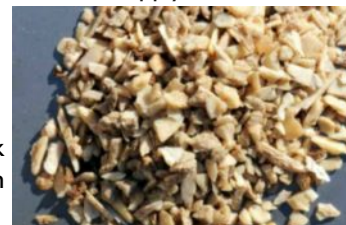
Food grade category 3 bones feedstock for ‘ABC’ production

Requirements: not competing with human food, animal feed and plant nutrition production and supply; and originating from environmental and climate protection sustainable source and supply.