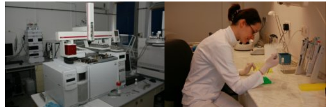
The REFERTIL proposed analytical methods for organic pollutants