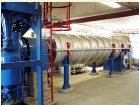
“3R” Zero emission pyrolysis equipment for ABC biochar production

Biochar is plant and/or animal biomass by-product or organic waste based stabile carboniferous substance for conservation agriculture applications. The biochar must be well defined and controlled quality, that is processed under reductive thermal conditions, and applied to improve the soil physical and/or chemical and/or biological properties or the soil activity and/or consists of organic materials of biological origin.